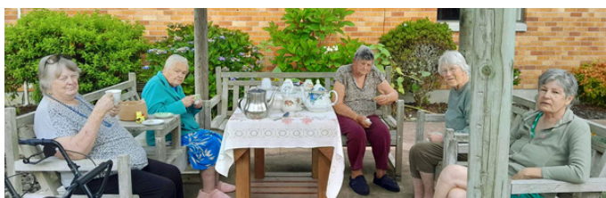
AFTERNOON TEA WITH LADIES IN KAURI WING

Every birthday in Kimihia is a cause for celebration! Our January celebrants (right) and the ones in February are here: