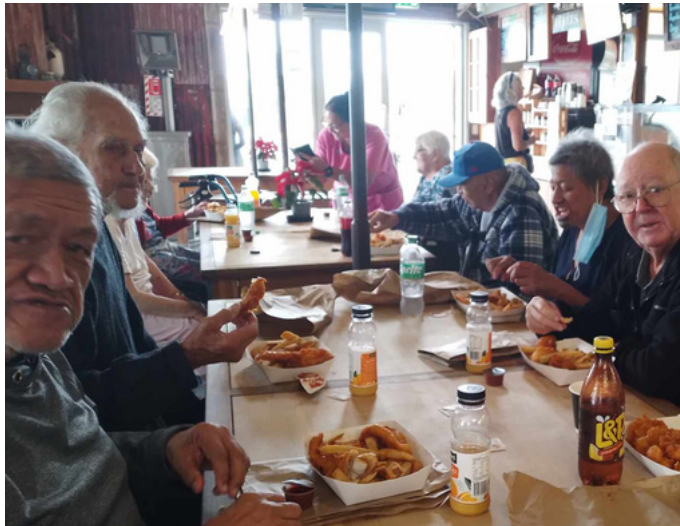
FISH & CHIPS AT 'THE WHARF' IN RAGLAN

Activities inside and outside of the facility are designed according to the needs and abilities of the residents. Outings promote social interaction and offer a break from their normal routines in the rest home. Lego and Jenga helps our Hospital wing residents with their hand and eye coordination and enhance creativity through play. Arts, crafts and afternoon tea time for our residents in Kauri wing activate memories and abilities that allows them to stay connected and keep their minds nimble.