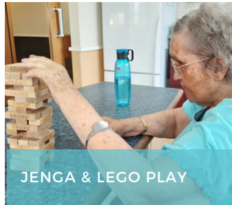
JENGA & LEGO PLAY