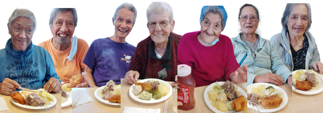
Residents prepared and feasted on Boilups, Fried Bread, Kamo Kamo & Riwai